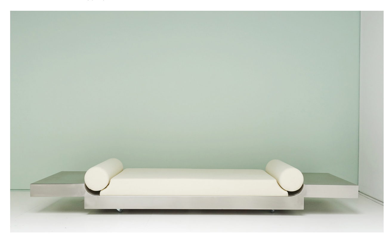
Maria Pergay Day bed, 1968 Satin stainless steel, leather 300 x 84 x 27 cm