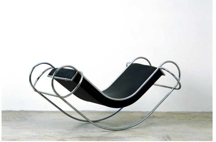
Jean-Michel Sanejouand "Symétrique" Rocking chair, 1970 chromed metal, leather 72 x 160 x 95 cm