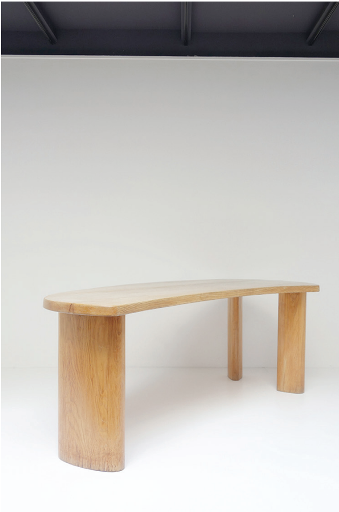
Charlotte Perriand / Pierre Jeanneret Free form desk, circa 1946