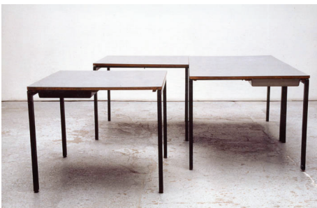
Le Corbusier / Charlotte Perriand Square table with drawers, 1956-59

Throughout her career, Charlotte Perriand was profoundly attached to providing and maintaining a quality of life, be it working class houses, urban or rustic dwellings, to mountain shelters or hotels. She wanted to protect the man and his environment by creating comfortable and functional furniture.