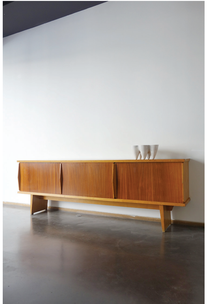
Charlotte Perriand / Pierre Jeanneret Sideboard, circa 1947