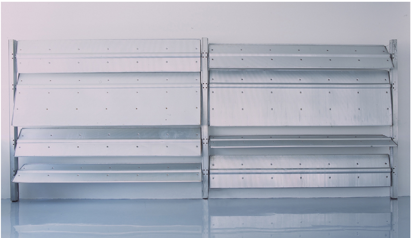
Sun shutter, 1957 aluminum 102.3 x 128.3 x 5 inches each Provenance : Union aéromaritime de transports, Conakry, Guinea, Africa