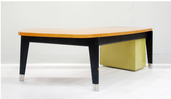
"Pr sidence" desk, circa 1950 oak, bent steel, aluminum 30 x 97 x 36 inches