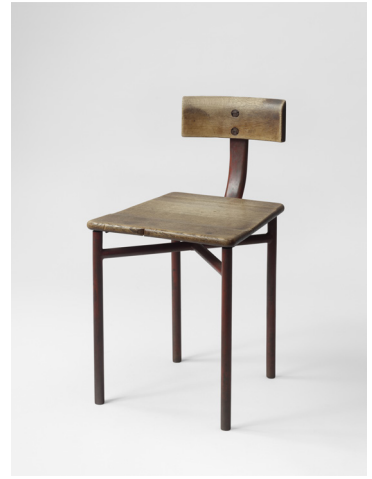
"Cit " chair, circa 1930 tubular steel, wood 29.2 x 15.5 x 18.3 inches   Herv  Lewandowski