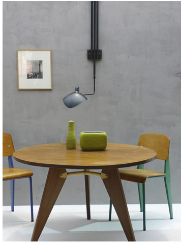
Pedestal table, circa 1946 metal, wood 28 x 47 inches