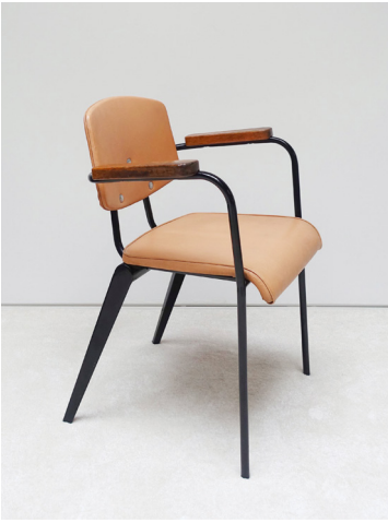
"Compas" armchair, circa 1950 bent steel, steel tube, wood, skai 31.1 x 23.2 x 20.9 inches