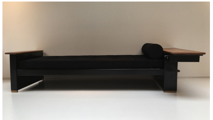
"Cit " bed, 1951 bent steel, wood 20.4 x 92.9 x 47.2 inches