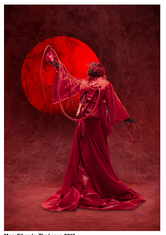
Mary Sibande, The Locus , 2019 Series I Came Apart at the Seams Inkjet on Hahnemuhle Photo Rag, Daisec Mount 200 × 136 cm

The violence rooted in the lives of these vulnerable populations has inspired the artist to reflect on different ways of channelling anger, resulting in an exhibition in the form of a vast sculptural and sound installation that occupies an entire floor of the Museum.