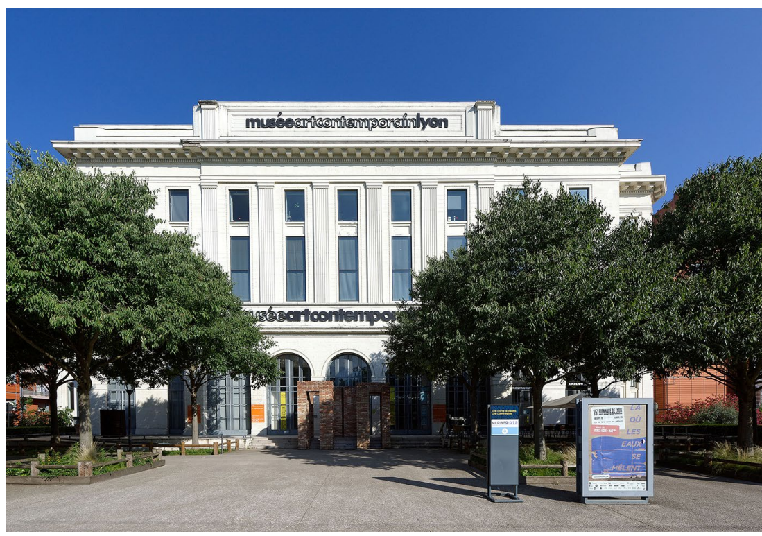
View of the Musée d'art contemporain de Lyon.

Brought together in an arts pole with the MBA since 2018, the two collections form a remarkable ensemble, both in France and in Europe.