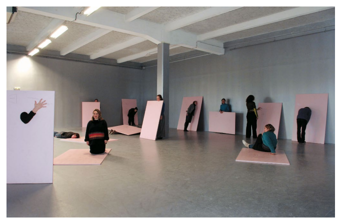
Erwin Wurm, Adorno was wrong with his Idea about Art, 2005 Pink painted wood panel set, collection macLYON Exibition view in Lyon Biennale of Contemporary Art, L'expérience de la durée, 2005 @ Adagp, Paris, 2022

This work comprises several wooden panels, painted in pink, on which diagrams accompanied by a sentence indicate proposals for action formulated by the artist: pass an arm or a leg through the holes in the panels and try to keep one's balance; lie down while putting one's finger in one's nose; slide under one of the panels and do not move... With the artist's accord, this set of "sculptures" to be made by the public has been resized to the proportions of a child's body for the purposes of this exhibition.